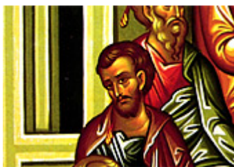
6. Saint Luke the Evangelist, who also was not present on this day, is included (detail).

In the center of the icon below the Apostles, a royal figure is seen against a dark background. This is a symbolic figure, Cosmos, representing the people of the world living in darkness and sin, and involved in pagan worship (7). However, the figure carries in his hands a cloth containing scrolls which represent the teaching of the Apostles (8). The tradition of the Church holds that the Apostles carried the message of the Gospel to all parts of the world.