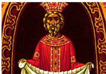
7. The Cosmos, appearing in the center of the icon, representing the people of the world (detail).

In the center of the icon below the Apostles, a royal figure is seen against a dark background. This is a symbolic figure, Cosmos, representing the people of the world living in darkness and sin, and involved in pagan worship (7). However, the figure carries in his hands a cloth containing scrolls which represent the teaching of the Apostles (8). The tradition of the Church holds that the Apostles carried the message of the Gospel to all parts of the world.