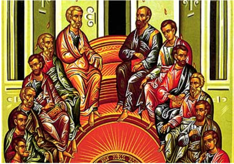
3. The Apostles in the upper room being filled with the Holy Spirit.