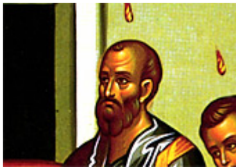
4. Saint Paul, who was not present on the day of Pentecost, is included amongst the twelve (detail).