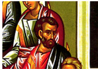
5. Saint Mark the Evangelist, who was not present with the twelve Disciples on this day, is included (detail).